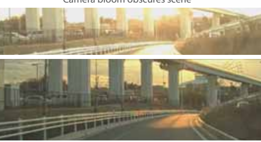
Details clearly visible